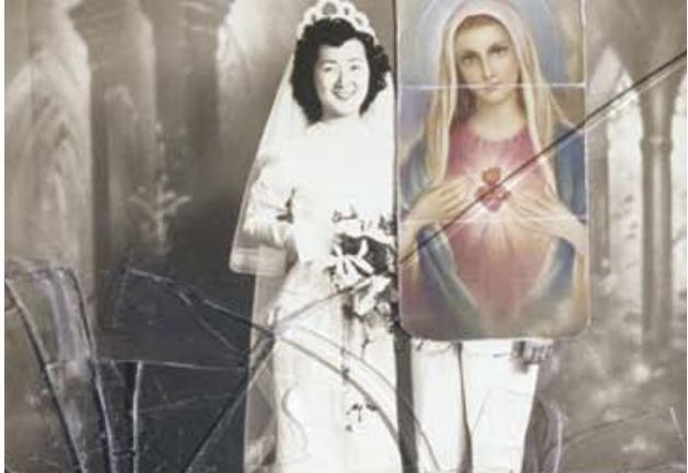
Gaye Chan Brides (June, July, August, September) Mixed media & photo